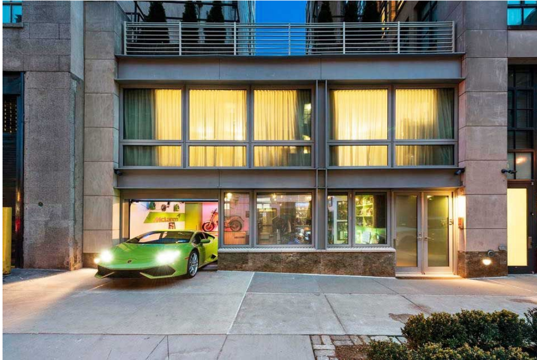
Owen Stuart's mansion