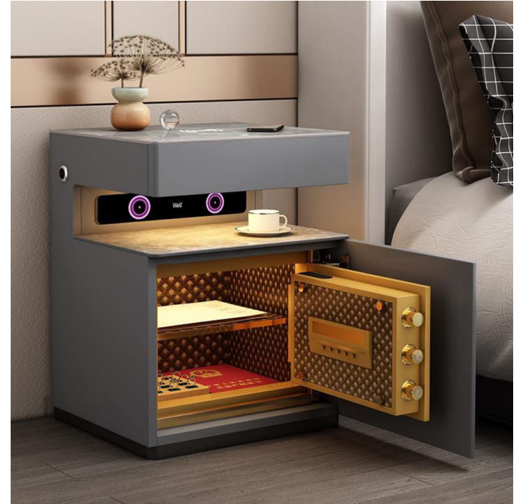
The safe with where the iPhone secrets were hidden.